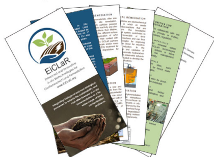
Introductory project brochure.

SPAQUE is leading the project's work package on outreach, engagement and dissemination. This work will support engagement with the EU and China remediation market and support the scale up, market awareness and business planning activities across the rest of the project. It will provide outreach to the wider public (e.g. via project brochures - see below) and offer meaningful technical and scientific dissemination to interested user groups such as regulators, contaminated land managers, industry, service providers and researchers.