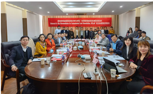
Kick-off meeting for the EiCLaR project, 6 April 2021, Nanjing, China.