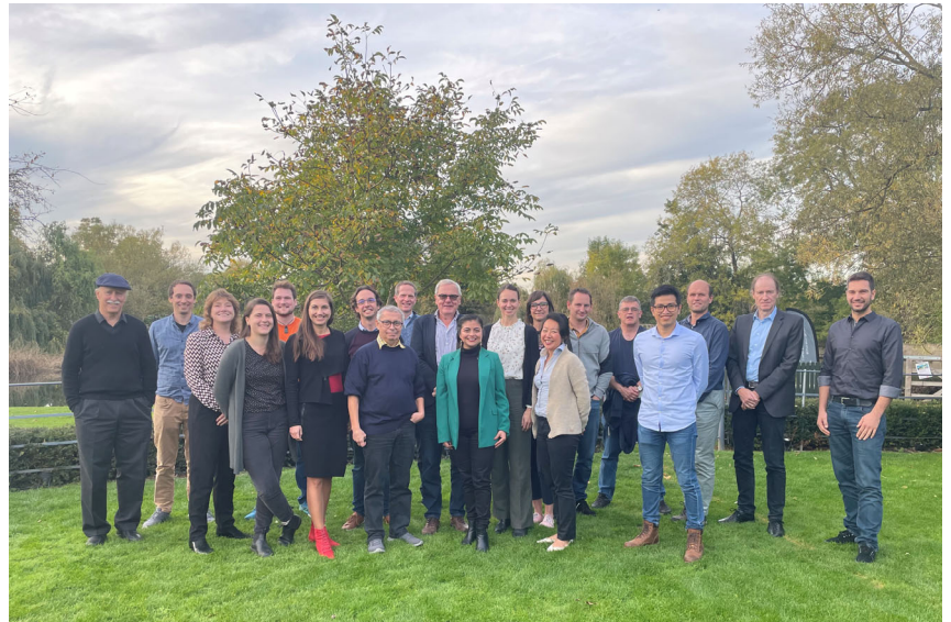
EiCLaR European project partners at annual meeting in Reading (October 2022).

Fortunately, the pandemic taught us all how to work effectively online and so the progress of the project has not been impacted. However, it has been very rewarding to get together once again and have these interactions in the same room (or over dinner).