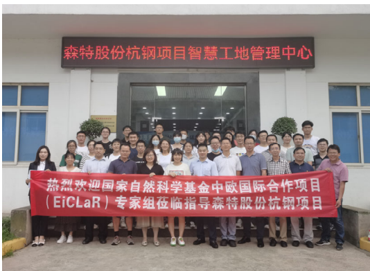
EiCLaR seminar organised and attended by Chinese project partners in Hangzhou (August 2022).