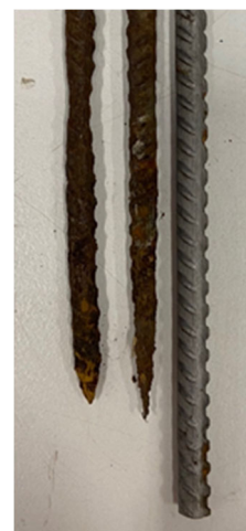
Figure 2. Corroded electrodes compared to an unused electrode after 1 week of the lab experiment.

The results of these studies showed that the amount of poorly crystalline iron oxides in soil substantially increased, enabling 76-89% of arsenic to be bound to this most reactive iron fraction. Due to the corrosion of the iron electrodes, the concentration of iron and abundance of poorly crystalline iron oxides were largest close to the electrodes. Nevertheless, over 10% of arsenic was still present in the most soluble and available fraction (exchangeable), which needs to be reduced further.